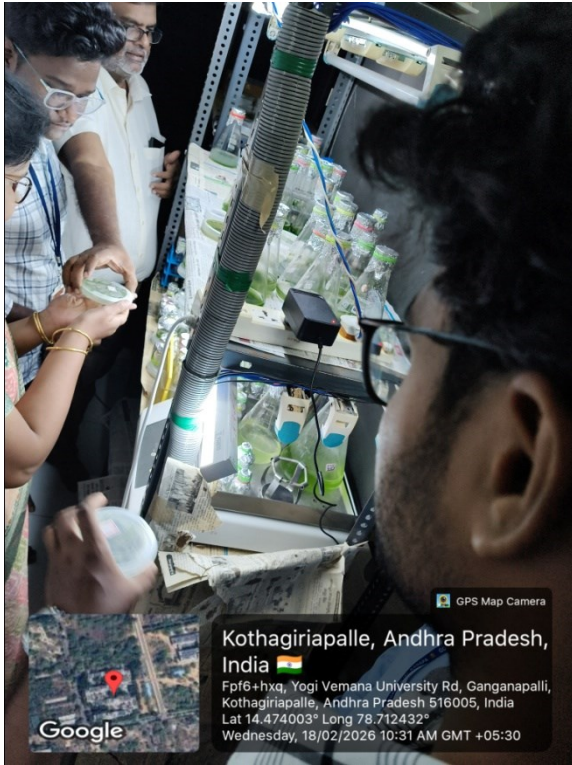
Students at algal culture facility