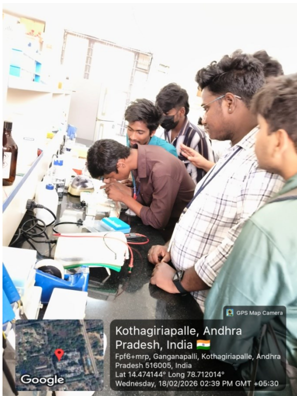
Loading DNA samples on to Gel