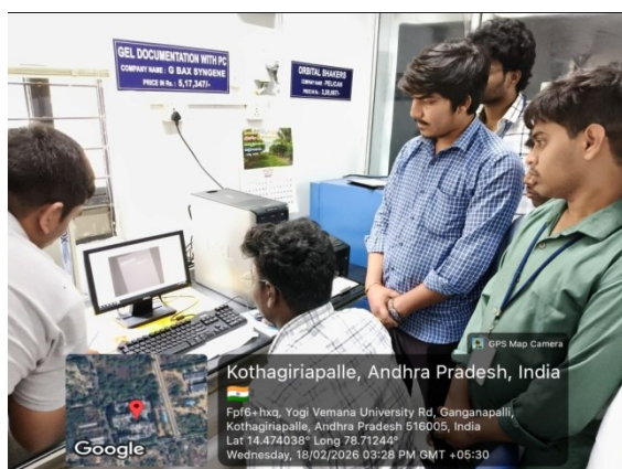
Observing DNA bands on gel

B. Sc., Biotechnology Students of IV semester visited Central Instrumentation Facility, Agri Science Park, Scanning Electron Microscope Facility, Animal House Facility, various departmental laboratories of science departments of Yogi Vemana University, Kadapa on 18.02.2026. Students visited laboratories, which contains major equipment, related to Biotechnology such as High speed centrifuges, Spectrophotometers, Nano spectrophotometer, FTIR, Thermal cyclers (for PCR), various distillation units, Gel documentation system, Electrolysis of water, Culturing of Algae, vertical and horizontal laminar air flow cabinets and animal cell culture facility. Students observed H & E stained lung tissue section using Inverted Microscope and also prepared agarose gel and loaded samples onto the gel. After running the gel for 25 min, students observed bands of DNA using Gel documentation system. Finally, students were motivated to go for higher studies especially in the research and to build capability to get jobs as well as to become entrepreneur.