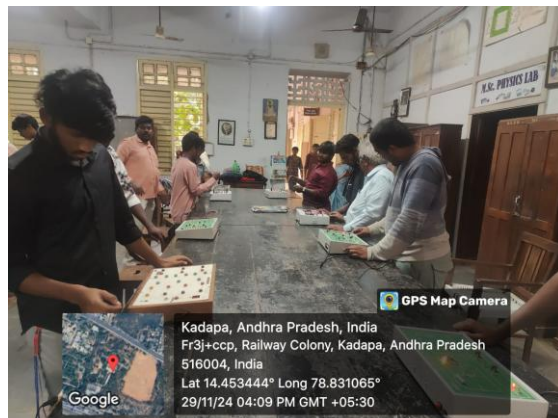
Hands on Experience